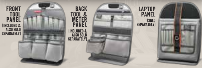
FRONT TOOL PANEL (INCLUDED & ALSO SOLD SEPARATELY)