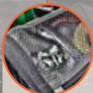
MAGNETIC SCREW CATCHER