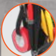
8" ELECTRICAL TAPE STRAP